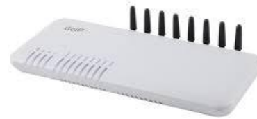
GSM Gate Way